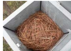
Nestbox with LBP nest & at Lake Mountain checking a box.

Meeting details for both days: Parks Victoria Office carpark. Symes Rd, Woori Yallock. Melways 286 F10. Time: TBC, but early as all day events.