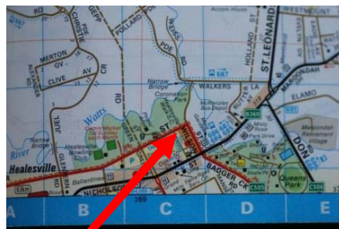
Meeting location Melways 270 C12