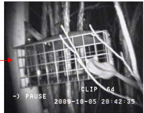
LBP entering feed station