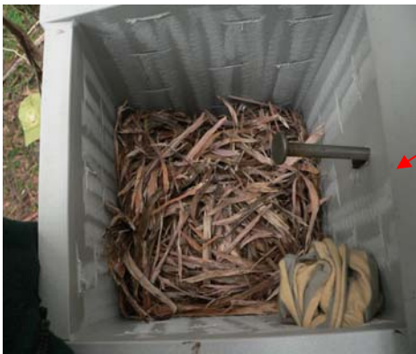
New nest April 2010

All training and observations that might be expected will be provided at the start of the season. At least one volunteer with a "Working at Heights" ladder training are required to deliver the feed into the raised feeding stations. Your observations will be recorded and added to an ongoing monitoring program for supplementary feeding Leadbeater's Possum.