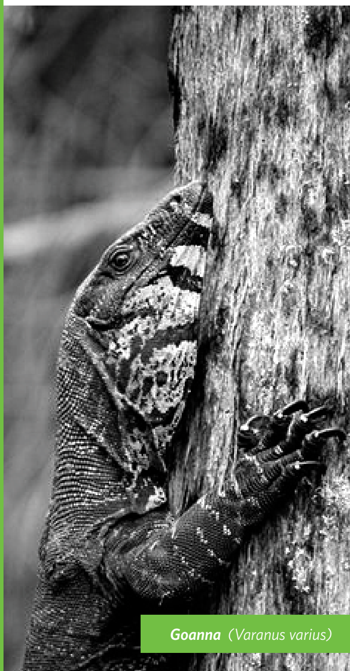
Goanna ( Varanus varius )

Native forest logging on public land should end. If any native forest logging is proposed in the future it should be subject to commonwealth environmental laws in the same way as every other industry, not exempted through the RFA regime.